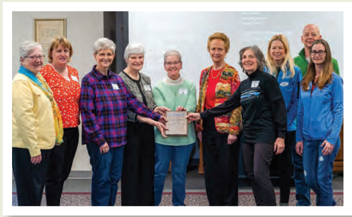
CSA Board accepts a plaque of recognition from the Glacial Lakes Conservancy Board.

vegetables, ... build a sanitarium, found a high school, and finally, construct our motherhouse in 2001, St. Agnes Convent, here on this spot, sacred to so many diverse peoples for several millennia and treasured by CSA for the past 124 years. Now we have placed this land in a conservancy with Glacial Lakes in order to preserve its pristine beauty for generations to come.”