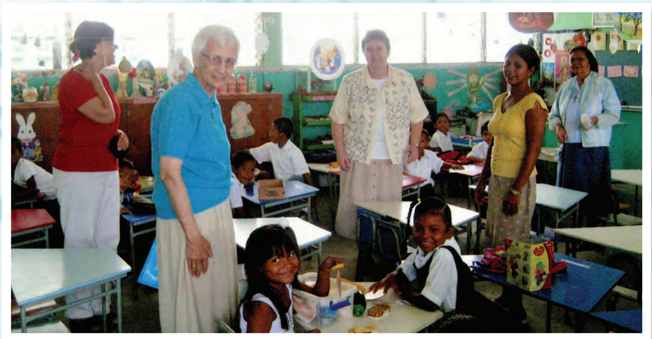
North American and Nicaraguan sisters work in partnership with the community to provide quality education.

Over the next several months, the testimonies and stories of the Sisters of St. Agnes in Latin America will be shared on the CSA website and social media channels. We invite you to join us as we explore how these two cultures have come together and walked side-by-side for the past 75 years.