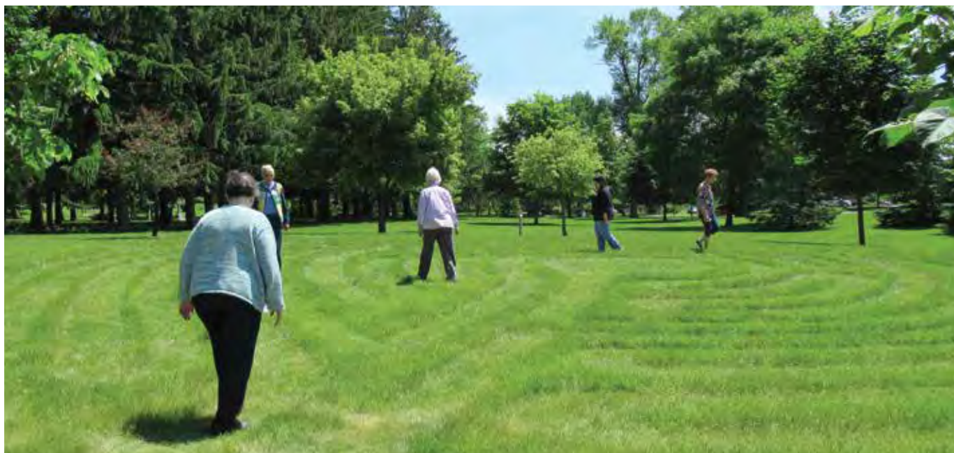
Associates pray in the Labyrinth.

the opportunity to ponder and share appropriate, pertinent topics related to our mission as associates. This experience was much different from my ‘normal’ busy, on-the-go days. At the end of the second day, I felt refreshed and renewed, eager to share my enthusiasm with others.”