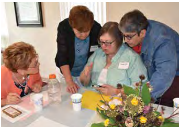
Associates discuss photos.

Monday's retreat topic was Contemplating our Baptismal Call: Listening, Responding, Walking . After a morning