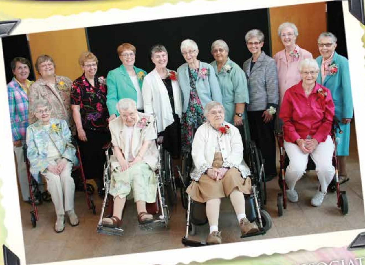
2019 CSA SISTER JUBILARIANS AND ASSOCIATES

For names and years of our 2019 Jubilarians, please see page 2.