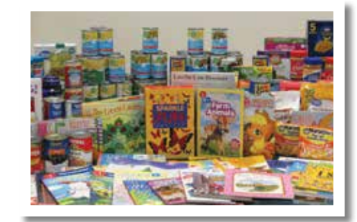
Food and Book Collection

action with renewed energy and enthusiasm, working hand in hand to create a flourishing CSA associate community.