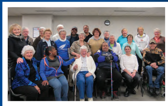
CSA sisters and associates with members of the civic community.

accepting and welcoming environment. An abundance of conversation, hugs, smiles, and promises of prayers, provide a feeling of warmth and friendship.