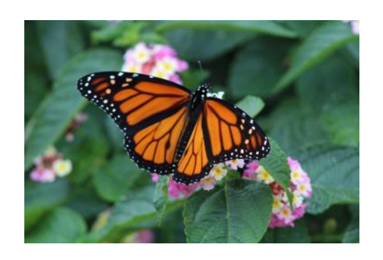
All rights reserved. Reprinted under OneLicense.net A-703845

Copyright © 1994, GIA Publications, Inc.