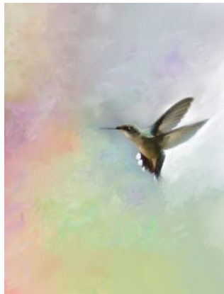
“Jubilee Joy”

It is said by indigenous people in many lands that the hummingbird brings joy and opens hearts to love. This hummingbird represents the Graced presence of God's Love over the lifetimes of those celebrating Jubilee, freeing them to joyfully serve. We share in celebration of them and the multiple ways they have brought joy to so many with their service, inspiration and encouragement. With gratitude we honor and bless the wonderful, colorful beauty of their wisdom and presence in our world today.