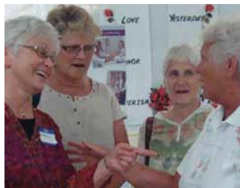
The reunion provided the opportunity to revisit fond memories of teaching and to reconnect with former co-workers.