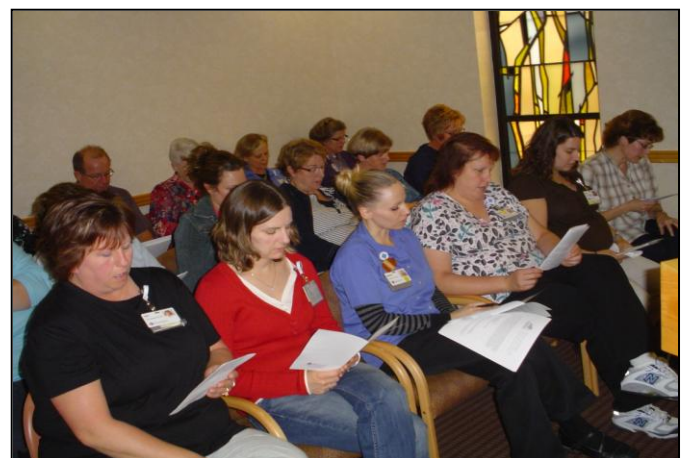
Employees at Waupun Memorial Hospital gather for a prayer service. Prayer services were held at other AHC locations, including St. Agnes Hospital, the Fond du Lac Regional Clinic at Mayville, and St. Francis Home.

The theme, Living our Mission: Every Choice, Every Day , extends beyond October and will continue to be given special attention in the months to come. While stewardship of Earth's resources and sustainability is the focus of Living Our Mission , the theme is also a reminder that all I do today is for the healing of the whole and that each choice throughout each day needs to flow from and further the mission of Jesus and be for the good of all .