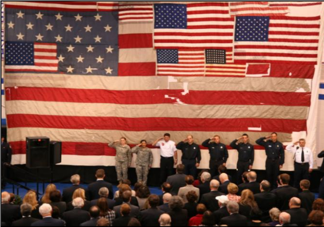
The National 9/11 Flag at Marian University

In the wake of the devastating collapse of the World Trade Center on September 11, 2001, a tattered 20-foot-by-30-foot American flag, now known as the National 9/11 Flag, was recovered from Ground Zero. This flag serves as the ultimate symbol of the transformation of tragedy into triumph and visually represents the American spirit.