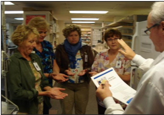
A Blessing of Hands was held at each of Monroe Clinic's eleven locations during the Mission & Values Celebration.