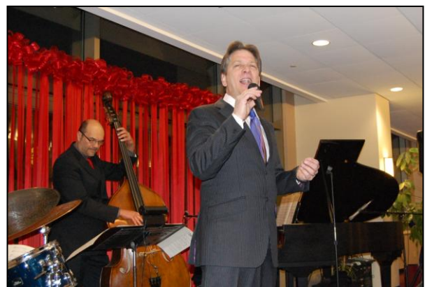
Steve March Tormé